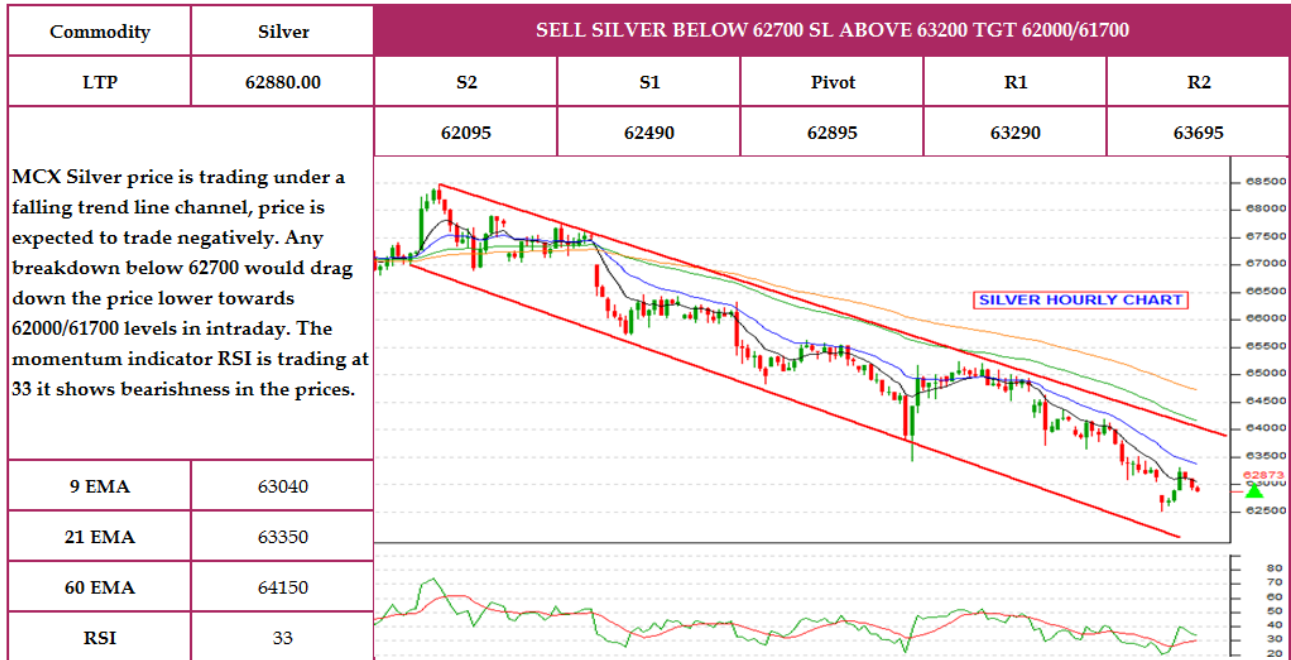
Chart of the days